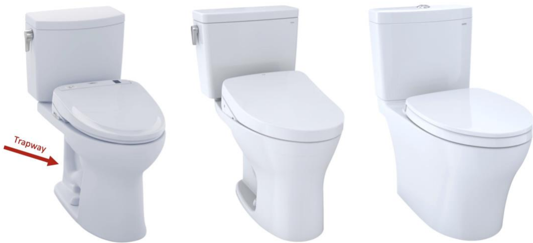
Non-Skirted Toilet TOTO Drake II WASHLET+ S350e

Deciding between these options is mainly a matter of aesthetic preference, but do keep in mind that skirted toilets are easiest to keep clean thanks to their sleek lines and limited contours. In comparison, it takes a bit more time and effort to clean around the trapway on a non-skirted or semi-concealed toilet.