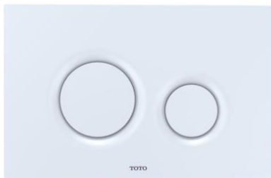
White Round (Upgrade)