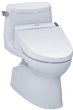
Elongated Bowl TOTO Carlyle II WASHLET+ C200

The majority of WASHLET+ toilets feature an elongated bowl, which is oval in shape. A handful of models, all of which are wall mounted, feature a D-shaped bowl (round in front and flattened in the back) or a square bowl