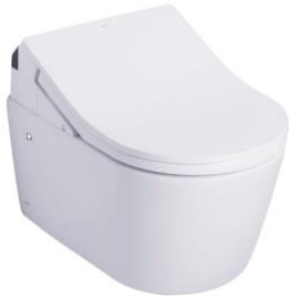
RP (Wall Hung)