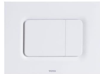
White Square (Upgrade)