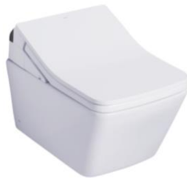
SP (Wall Hung)