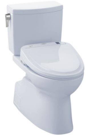
Push Button TOTO WASHLET+ Aquia IV S550e

A few floor-mounted WASHLET+ toilets feature a push button that's located on the top of the tank, giving the toilet a modern look. Push buttons only come on dual-flush toilets, and the position of the button means that none are ADA compliant. Currently, only the Aquia toilet line features push buttons.