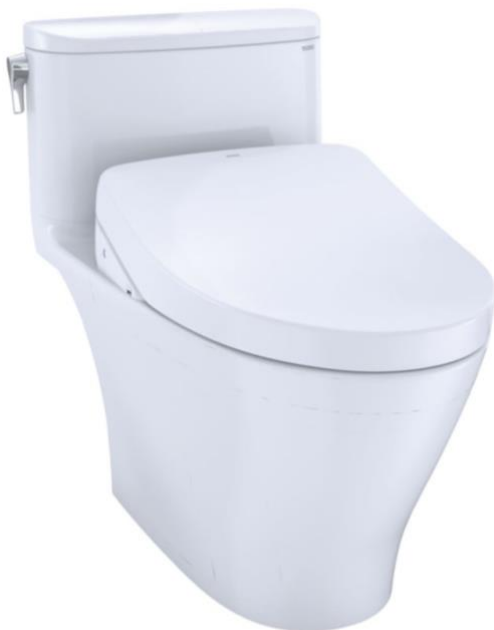
Nexus WASHLET+ One-Piece Toilet

Some WASHLET+ models come in both one-piece and two-piece versions, while other models come only in one or the other. For example, Nexus WASHLET+ toilets (pictured below) are available in both one- and two-piece iterations, while Drake II toilets are two-piece only.