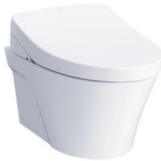
AP (Wall Hung)