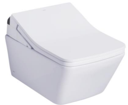
Square Bowl TOTO SP WASHLET+ SX