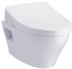
EP (Wall Hung)