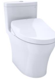
Aquia (One Piece)