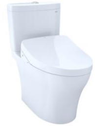
Aquia (Two Piece)