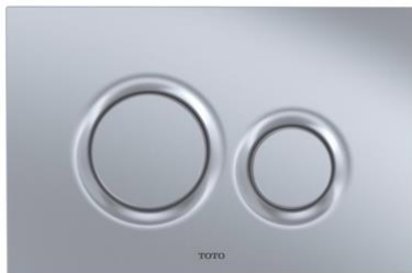
Matte Silver with Round Buttons (Default)