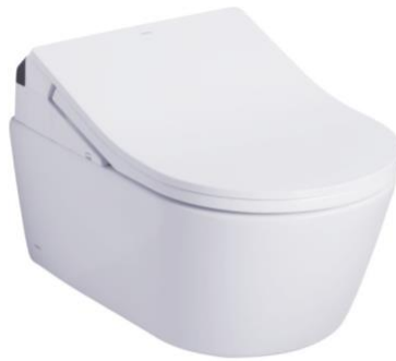
D-Shape Bowl TOTO RP WASHLET+ RX