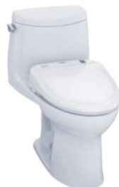
Ultra Max II