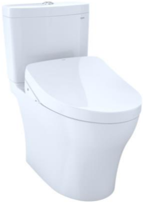
Trip Lever TOTO WASHLET+ Vespin II 1G S300e

The vast majority of floor-mounted WASHLET+ toilets have a trip lever that's similar to what you'd find on a traditional toilet. Pressing the lever lifts the flush valve inside the toilet, thus initiating the flushing process. All single flush toilets feature a trip lever mechanism, and some dual flush toilets come in this style too. Many (though not all) trip lever toilets are ADA compliant, meaning that they have a minimum seated height of 17" and their trip lever can be installed on either the right or the left side of the toilet.