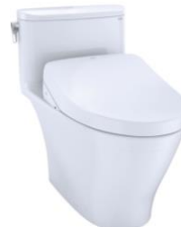
Nexus (One Piece)